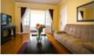
Sc Living room 2nd view.jpg

Thursday, 06 September 2012 21:54 - Last Updated Thursday, 06 September 2012 22:21