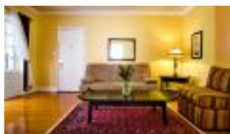
Sc Living room.jpg